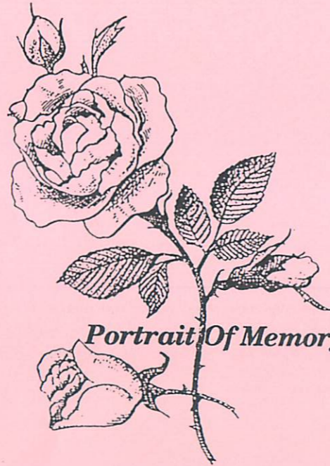
Portrait Of Memory